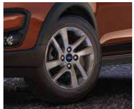
R15 Alloy Wheels

Other Accessories: Automatic Headlamps | Engine Undershield | Anti Theft Nuts | Neck Rest & Pillow | Rear View Camera | Roof Cross Bars | Smart Ambient Lighting | Shark Fin | Car Cover | Ash Tray