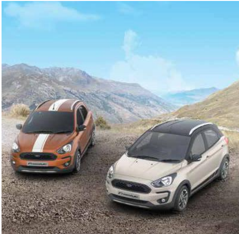
Body Stripe Kit & Roof Wrap

Crank up the style factor. Make your Ford Freestyle stand out from the crowd with our range of accessories.