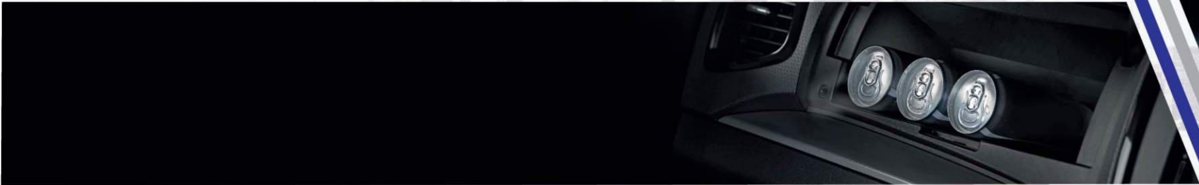
KEEP COOL BOX