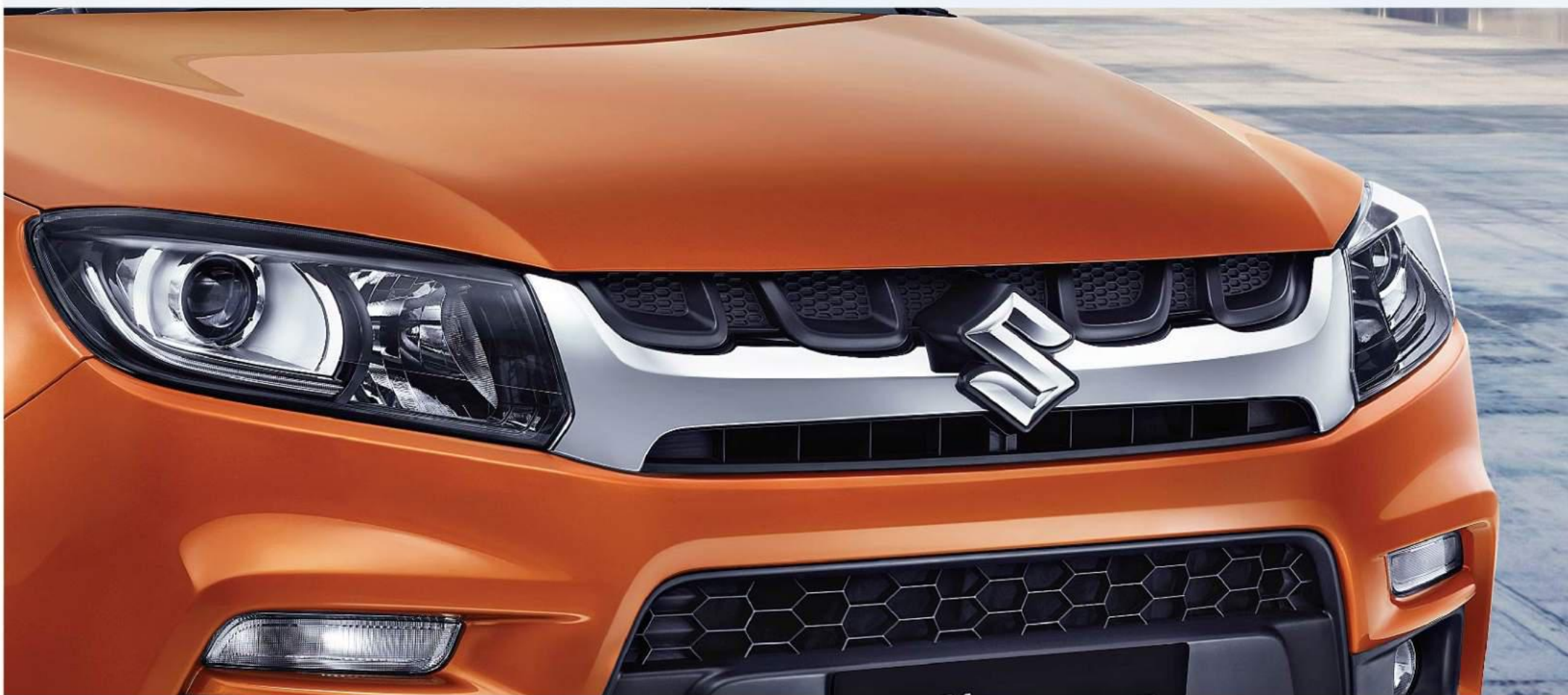
BOLD FRONT GRILLE