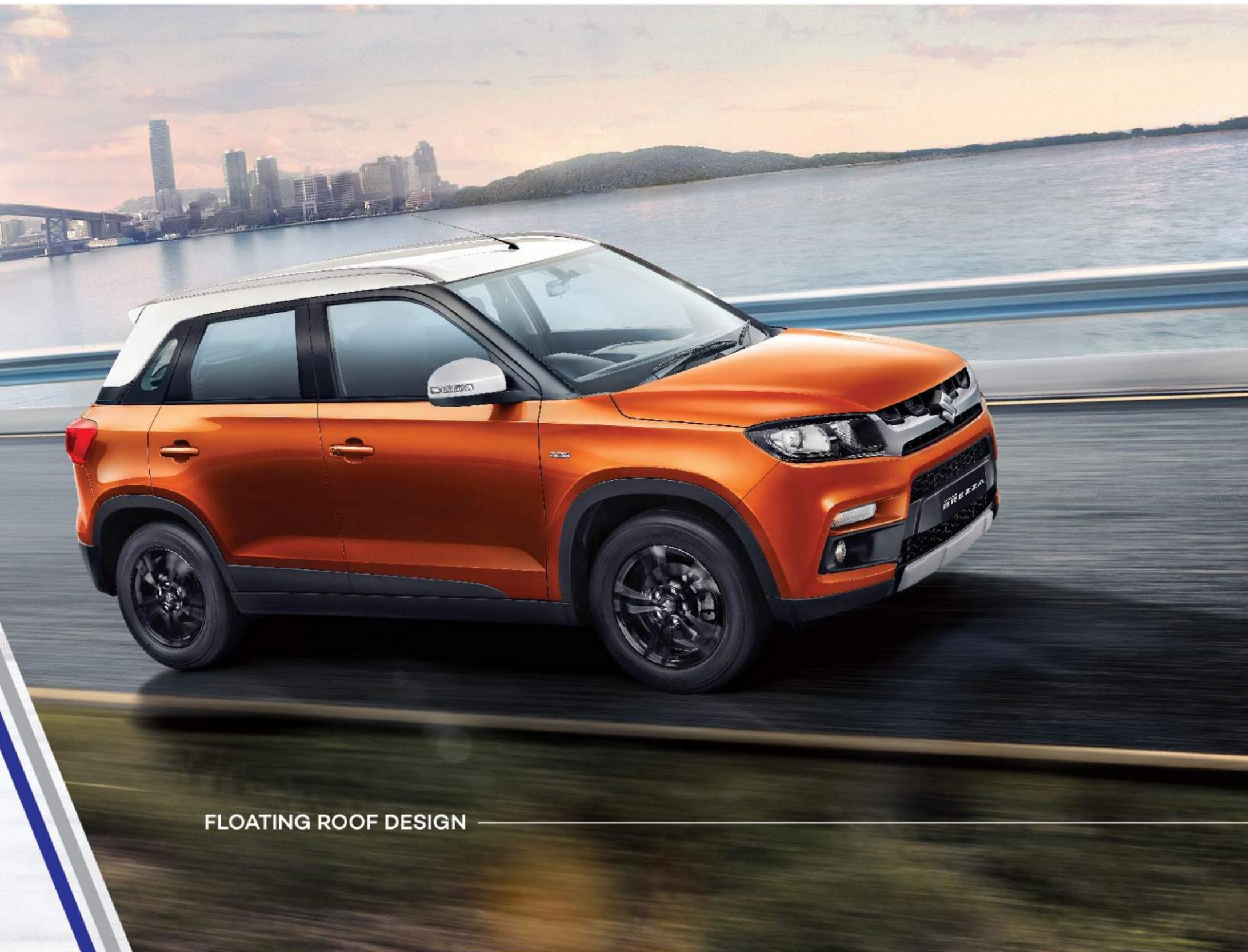
FLOATING ROOF DESIGN —