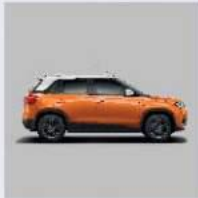
Autumn Orange with Pearl Arctic White

*VDA Method | **Fuel efficiency as certified by the test agency under rule 115(G) of CMVR. The black glass in the vehicle is due to lighting effect. Maruti Suzuki India Limited reserves the right to change without prior notice prices, colours, equipment specifications and also discontinue models. Images are for reference purpose only. Accessories and features shown in the pictures may not be part of candid equipment. Features shown may vary from variant to variant. Colours may vary from actual body colour due to printing on paper. All images in this brochure are creative visualization. For illustration purposes only. 2020 sales points, 3200 service centres, 1652 cities covered by service network and over 34293 trained sales personnel as of 1st April 2017.