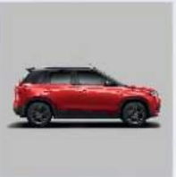
Blazing Red with Midnight Black