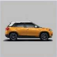
Fiery Yellow with Pearl Arctic White