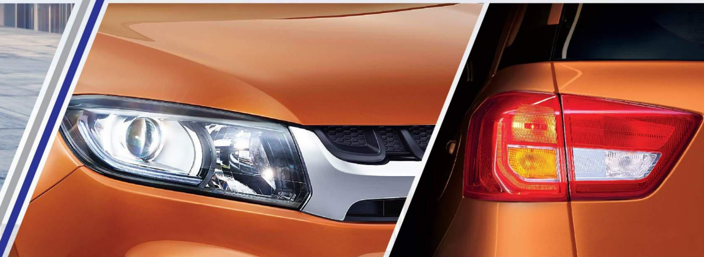
PROJECTOR HEADLAMPS WITH FRONT AND REAR BULL HORN LED LIGHT GUIDES