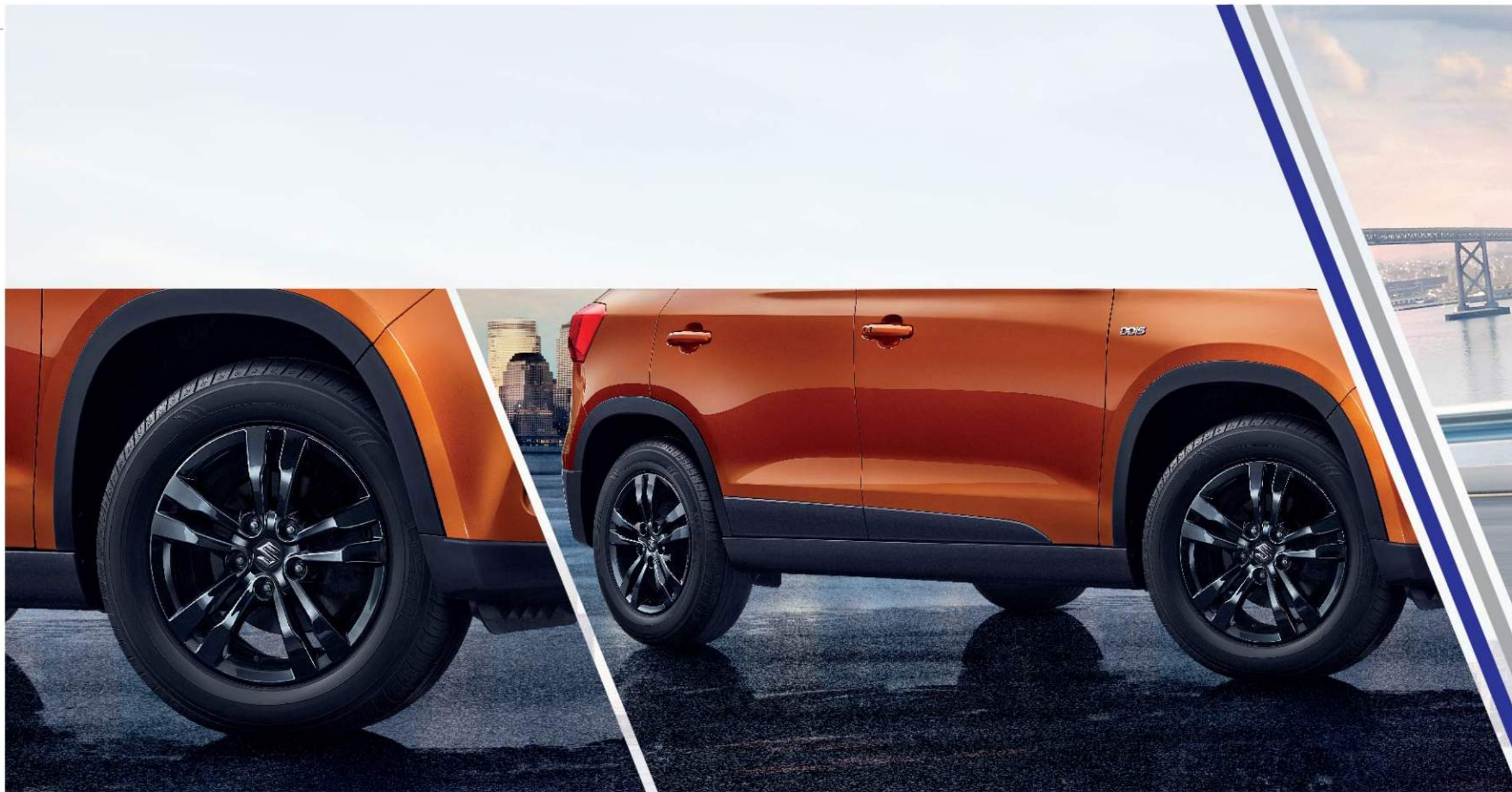
— GLOSS BLACK ALLOY WHEELS