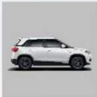
Pearl Arctic White