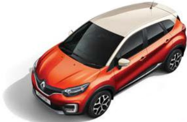
CAYENNE ORANGE BODY WITH MARBLE IVORY ROOF