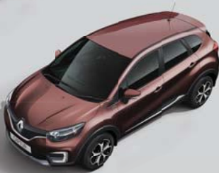
MAHOGANY BROWN BODY & ROOF