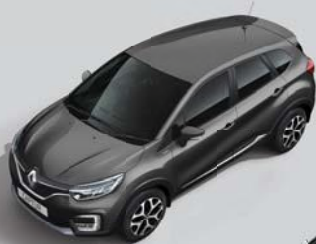
PLANET GREY BODY & ROOF