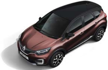
MAHOGANY BROWN BODY WITH MYSTERY BLACK ROOF