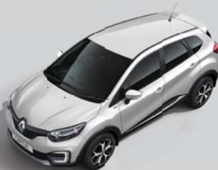
PEARL WHITE BODY & ROOF