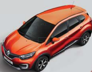
CAYENNE ORANGE BODY & ROOF