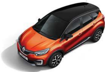
CAYENNE ORANGE BODY WITH MYSTERY BLACK ROOF