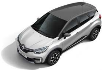
PEARL WHITE BODY WITH PLANET GREY ROOF