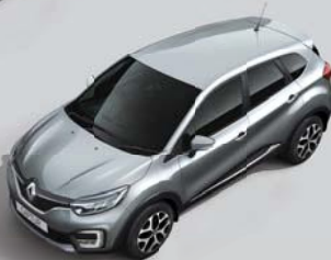
MOONLIGHT SILVER BODY & ROOF