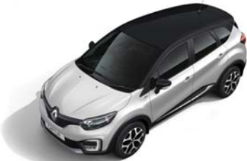
PEARL WHITE BODY WITH MYSTERY BLACK ROOF