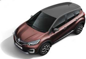
MAHOGANY BROWN BODY WITH PLANET GREY ROOF