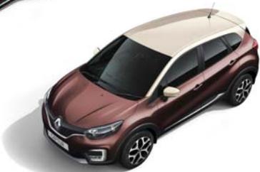
MAHOGANY BROWN BODY WITH MARBLE IVORY ROOF